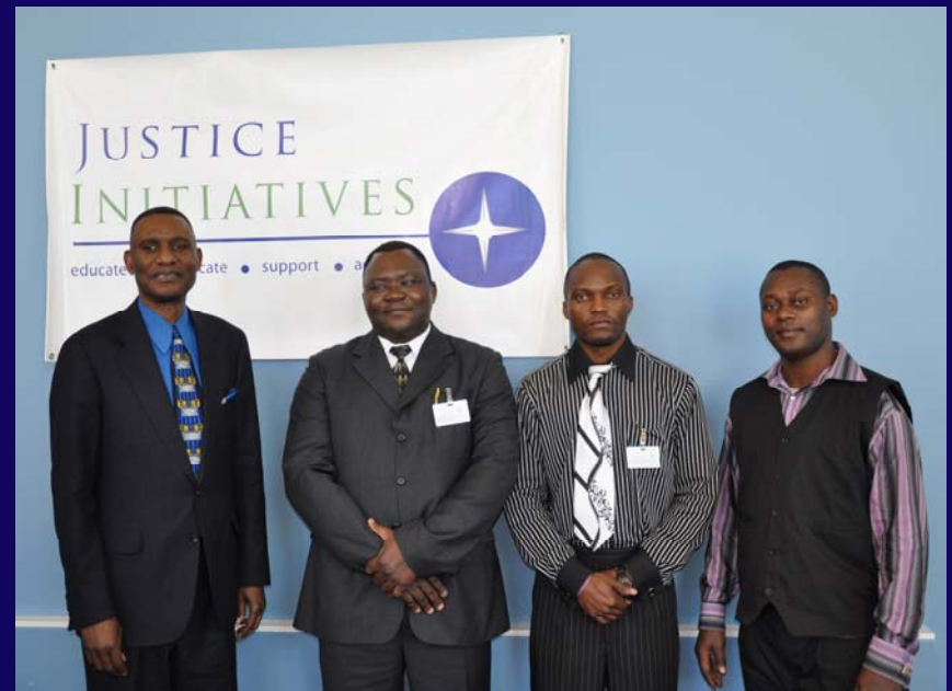
Members of the African Congolese